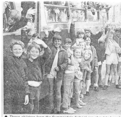
These children from the Summerdale School are about to board a bus which will take them to the Little Athletics meeting at White City. It's an outing they all look forward to each Friday.

Little Athletics proved over the years to be very popular amongst Tasmanian children and would produce many great athletes who would go onto greater things within the Australian and international athletic and sporting community. There have been many notable athletes who represented Australia at Commonwealth and Olympic Games, as well as those leading successful careers in other sporting codes.