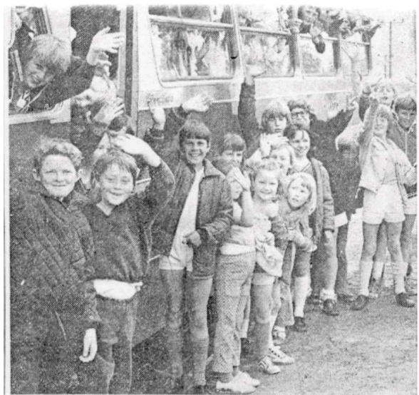
● These children from the Summerdale School are about to board a bus which will take them to the Little Athletics meeting at White City. It's an outing they all look forward to each Friday.