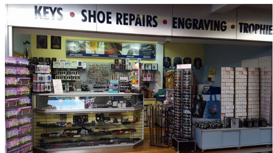
Trophies & Trades Express Howrah