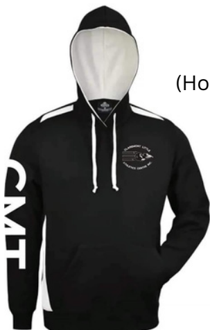
Hoodies $60 (Hoodies are optional)